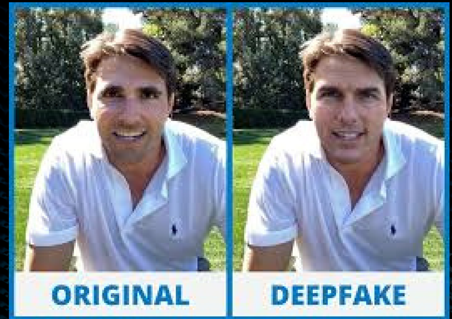
Figure One: Example of how accurate deep fakes can be

Deep fakes work by using two different Ai systems simultaneously. The first system scans videos and audios of the victim, and generates a tampered replica. The second compares the deep fakes image to the real images to make sure it's as accurate as possible.