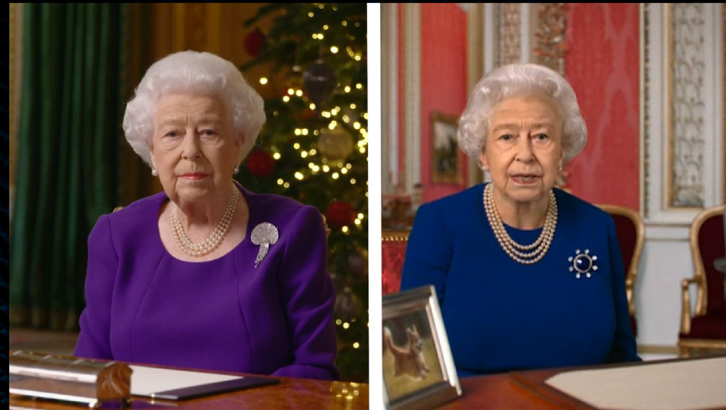
Figure 3: Deepfake Queen Elizabeth delivers alternative Christmas speech